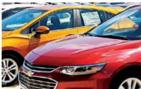
Cars on the sales lot of Hudiburg Chevrolet on the Tinker Diagonal in Midwest City on Monday. On Thursday, the Oklahoma Supreme Court upheld a 1.25-percent sales tax on vehicle purchases.